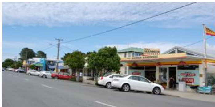
Above: Waipu Town Centre

Reference: http://www.bydand.hopto.org/games2010/index.html