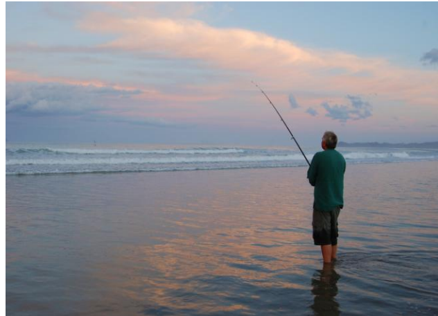
Pictured above: Fishing at Uretiti Beach

Ruakaka Beach lies near the mouth of the Ruakaka River which boasts a rare bird reserve and popular summer camping ground. It is primarily a residential area made up of a mixture of permanent homes and beach shacks.