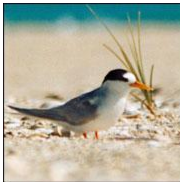
NZ's endangered fairy tern makes its home at Mangawhai Heads

For detailed information regarding more of the great walks in northland, go to the Department of Conservation website www.doc.govt.nz