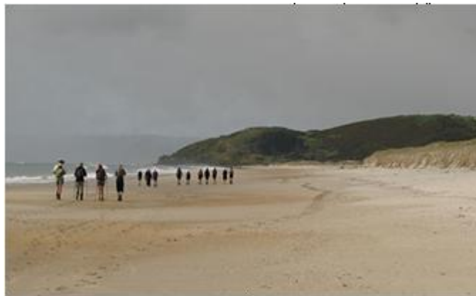
Part of the Brynderwyn Walkway

Access to this walkway can be gained from State Highway 1 (approx 1 mile north of Dargarville turn-off) or from Massey and Cullens Road at Waipu. It is worth noting that unless you retrace your steps, a car is required at the exit points on these walks. It takes approx 4.5 – 5 hours to walk from State Highway 1 to the exit on the Mangawhai-Langs Beach Road.