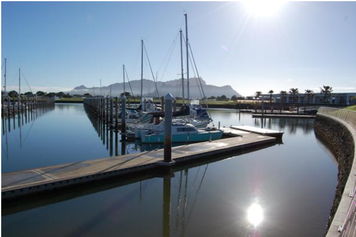
MARSDEN COVE MARINA

or drop into the Whangarei i-Site Visitor Centre, 92 Otaika Rd, Whangarei 09-4381079 Email: info@whangareinz.com