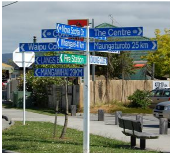
Going wild in NZ