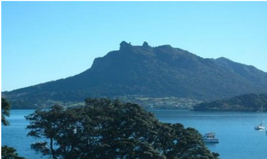
View of Mt Manaia

One Tree Point School is a coeducational contributing primary (years 1-6) school with a decile rating of 4 and a roll of 181. The school was established in 1972.