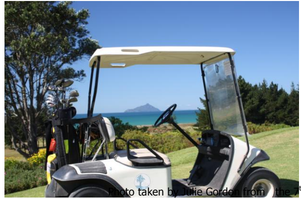
from the 7 th tee at Waipu