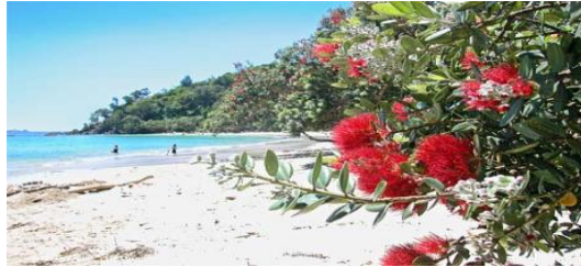
North Island Pohutukawa Tree